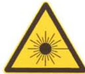
Laser Class 4

All specifications are subject to change without notice.